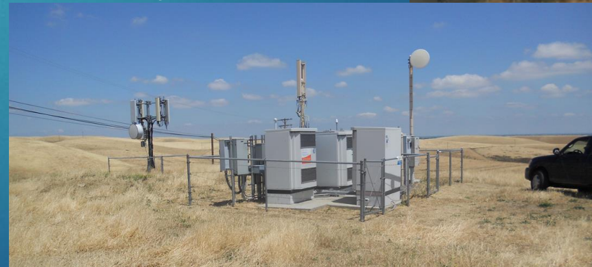
Vasco Hills Communication Site (Sprint T-Mobile)