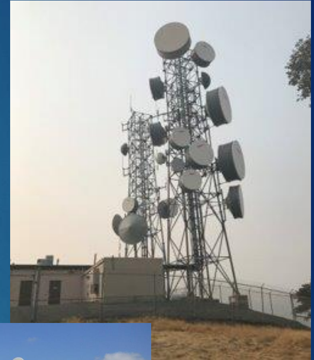
Black Diamond Mines Communication Site (PG&E)