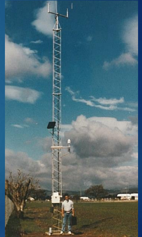
South County Corporation Yard (Bay Area Air Quality Management District Site)