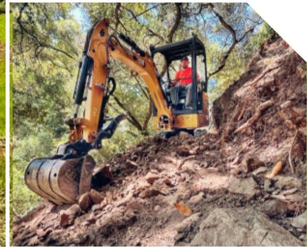
NEW TRAIL BUILD