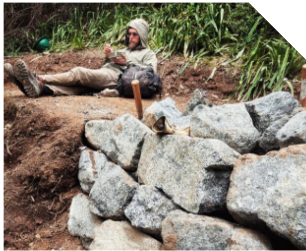
THE ART OF STONE