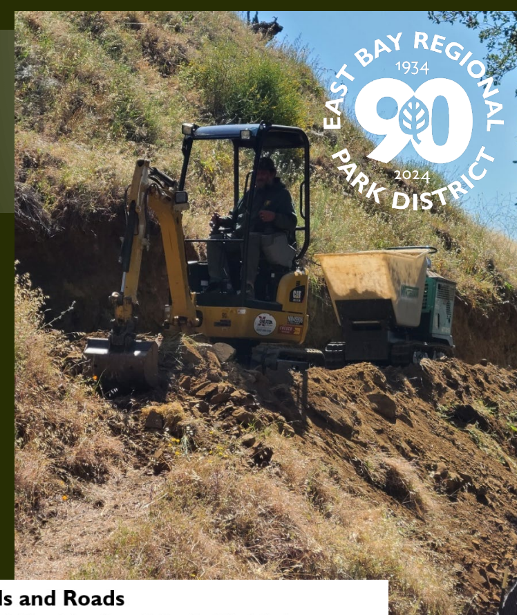
Trails and Roads Operated by the East Bay Regional Park District Mileage by Type Total = 1,330 Miles*