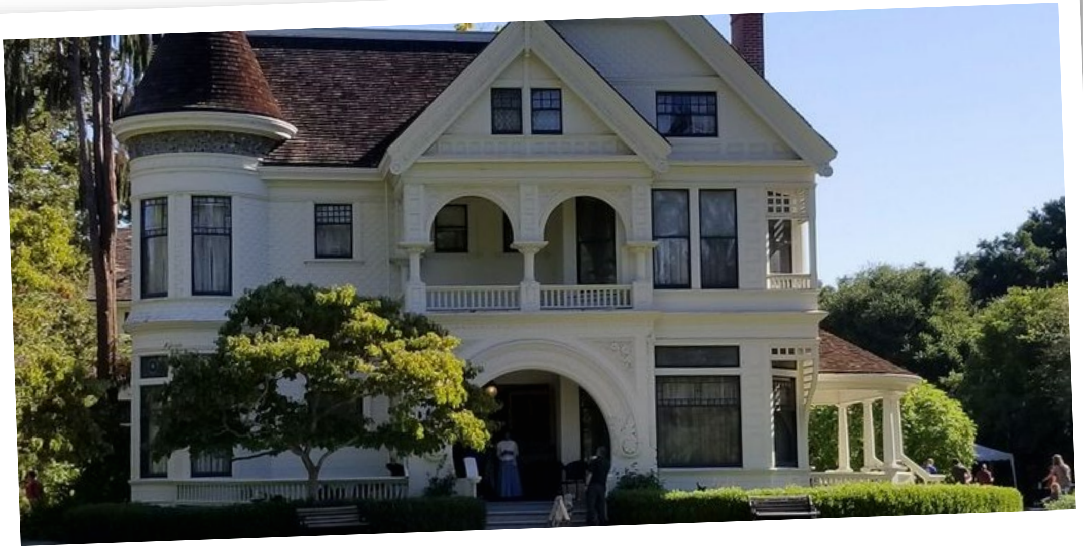
16-room Victorian-era Queen Anne mansion Seasonal Tours on Thursdays, Fridays, and Sundays