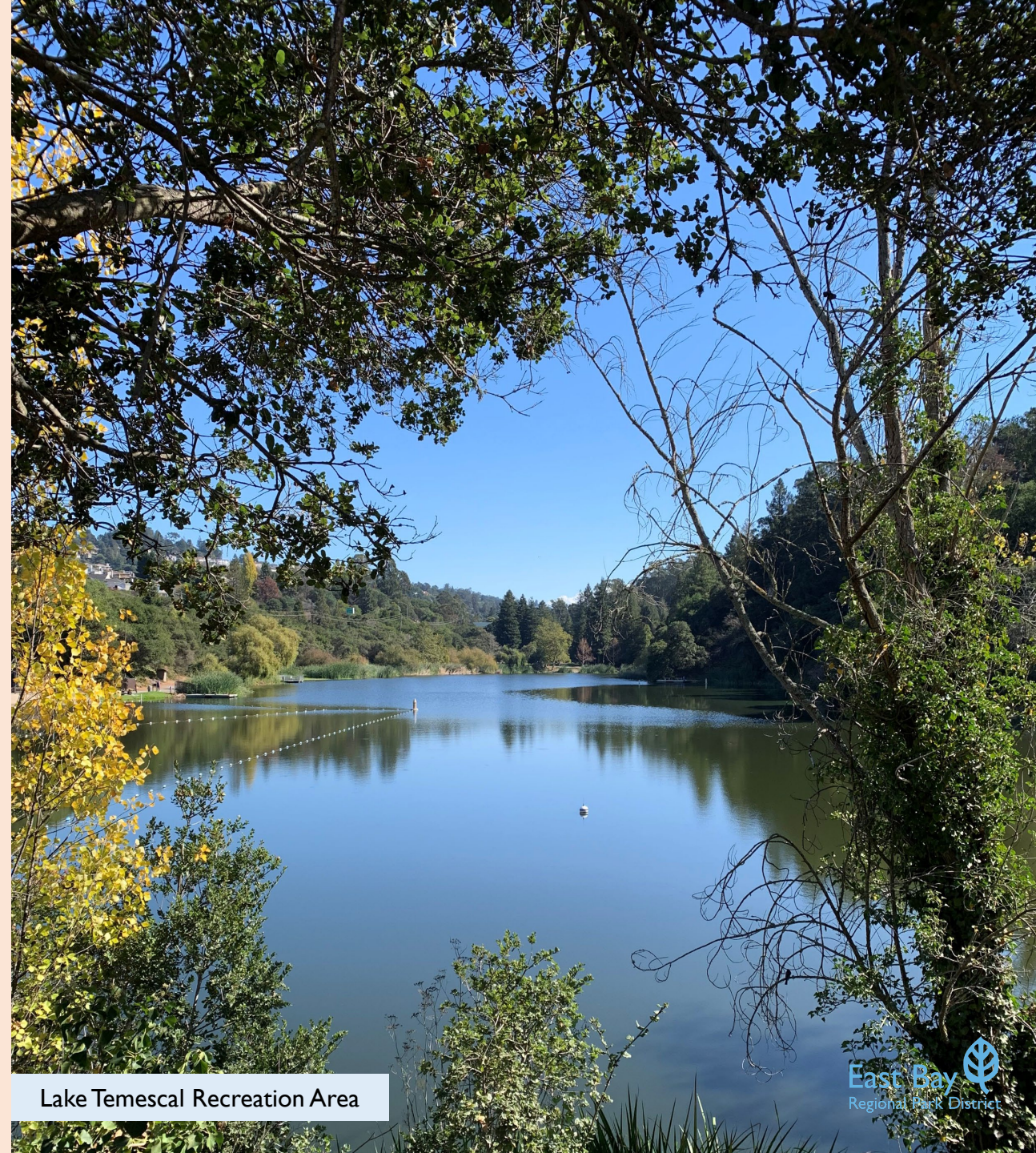
Lake Temescal Recreation Area