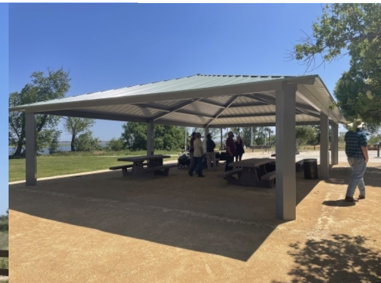
Big Break Shade Structure Replacement