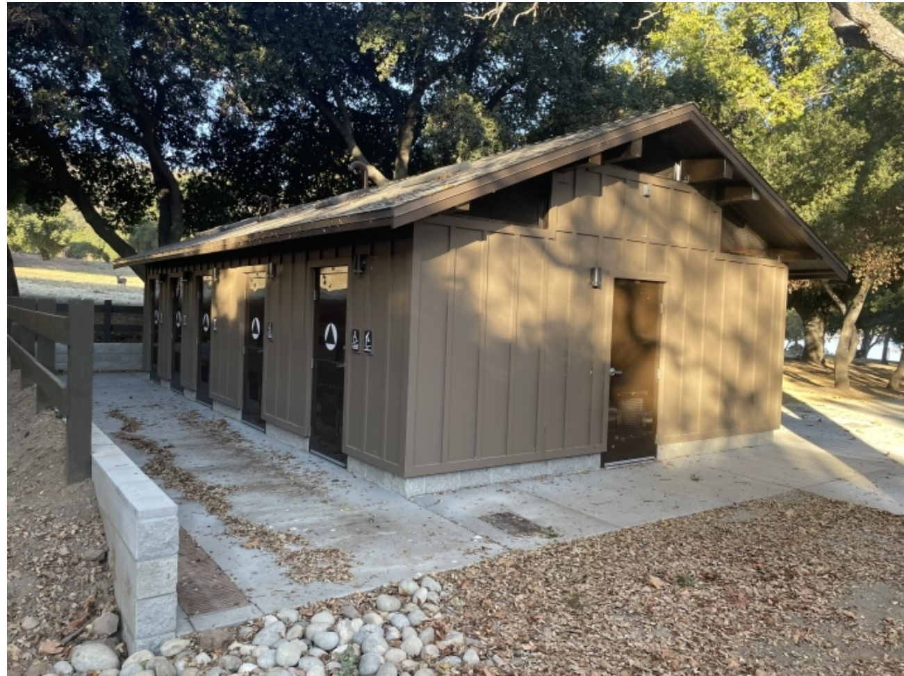
Del Valle West Toilets Replacement