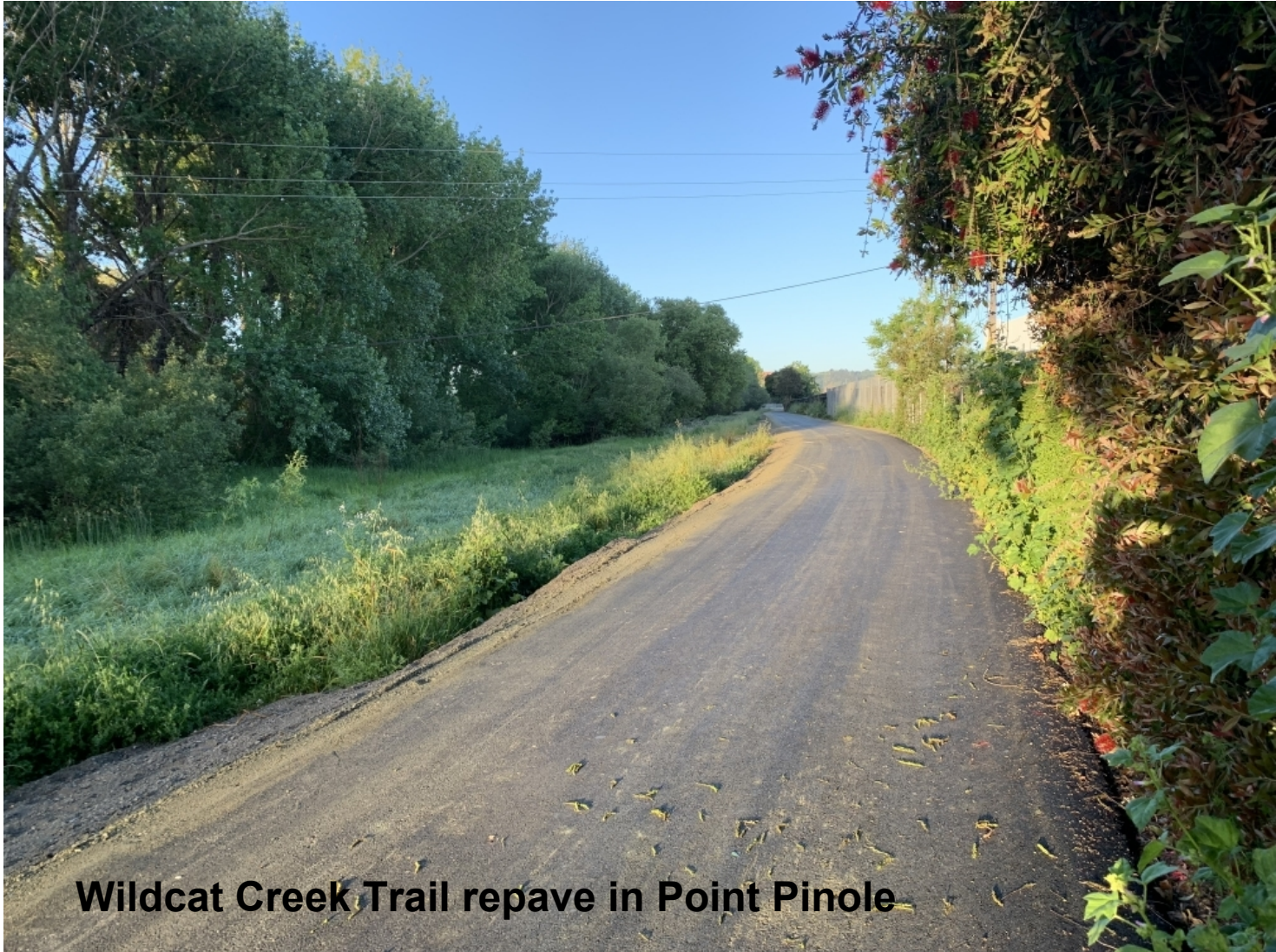
Wildcat Creek Trail repave in Point Pinole