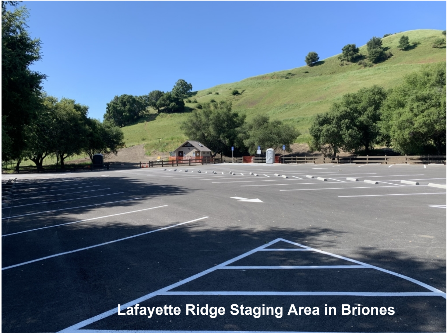
Lafayette Ridge Staging Area in Briones