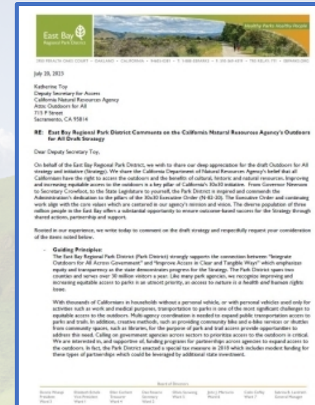
Pictured Left: EBRPD response to the California Natural Resources Agency's Outdoors for All Draft Strategy