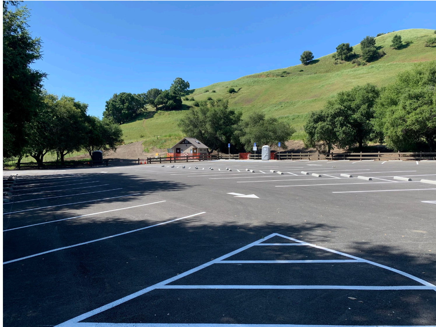
Lafayette Ridge Staging Area in Briones