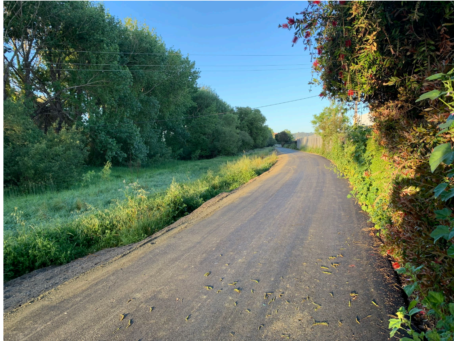
Wildcat Creek Trail repave in Point Pinole