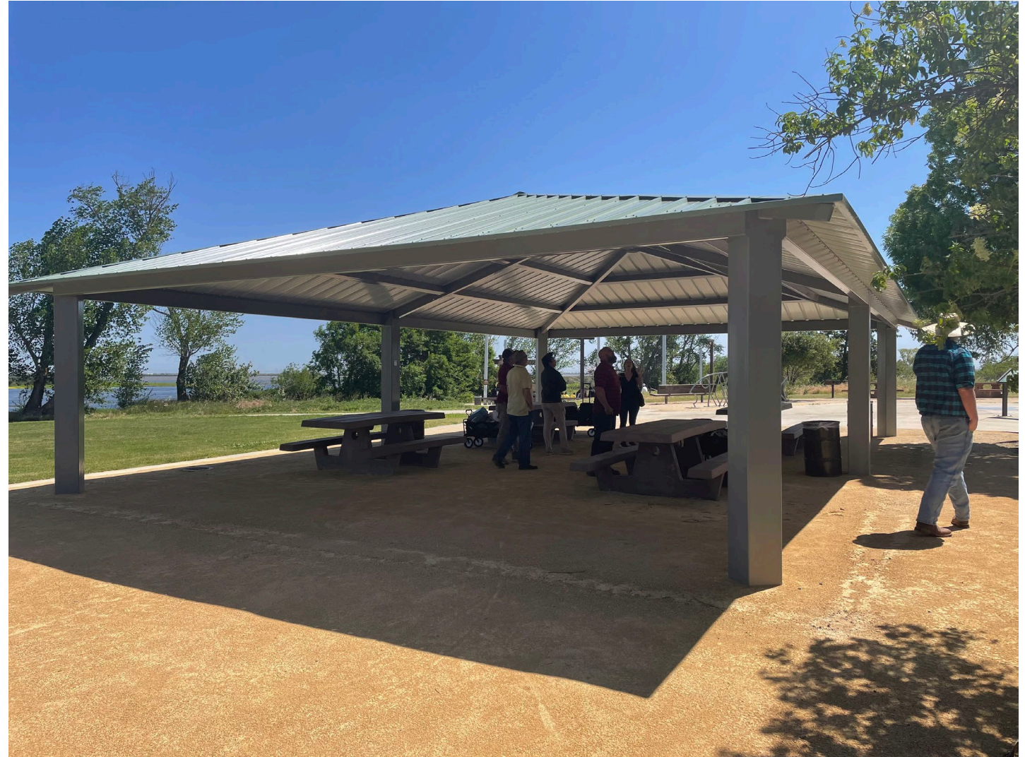
Big Break Shade Structure Replacement