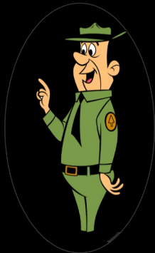
Vacant Park's Transportation Supervisor