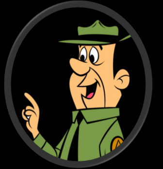
Vacant Supervising Naturalist