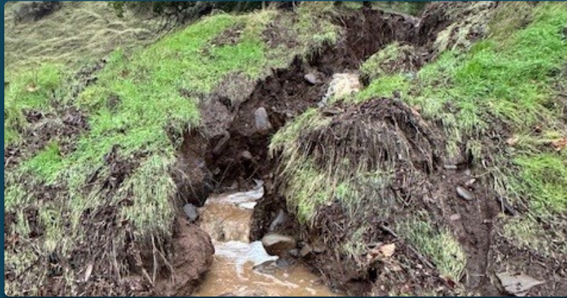
Campground Culvert Damage