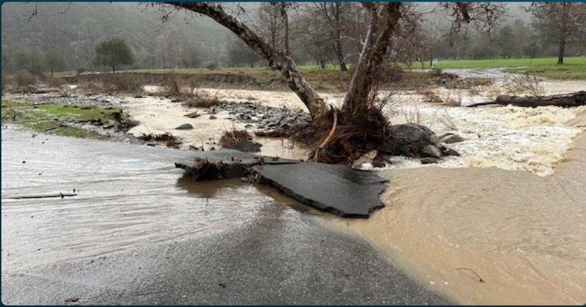
Road Access Flooding