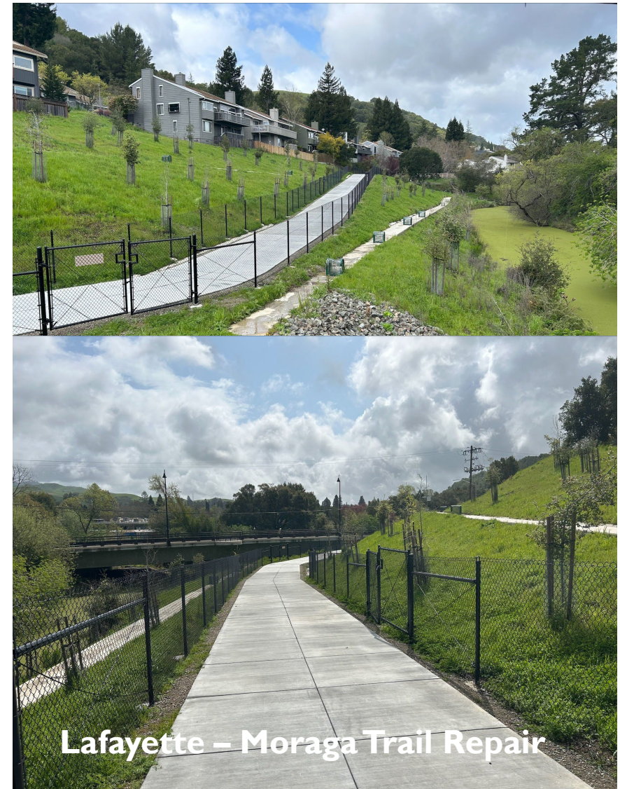
Lafayette – Moraga Trail Repair