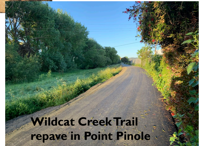
Wildcat Creek Trail repave in Point Pinole