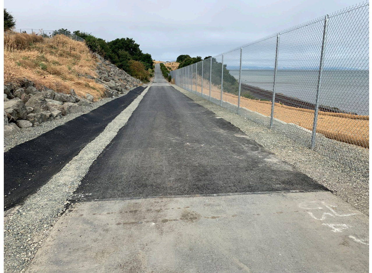
Pinole Shores Trail Repair