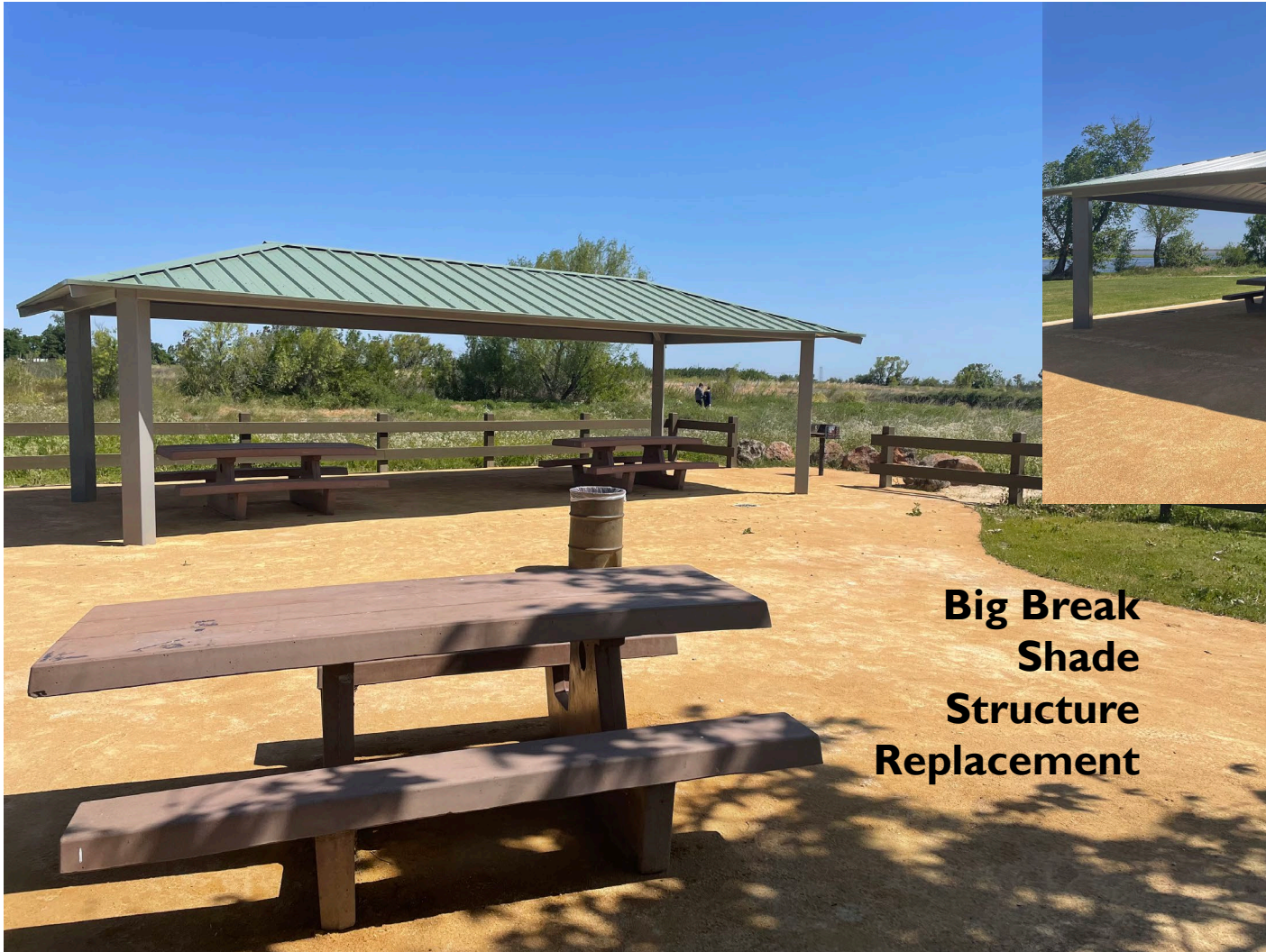
Big Break Shade Structure Replacement