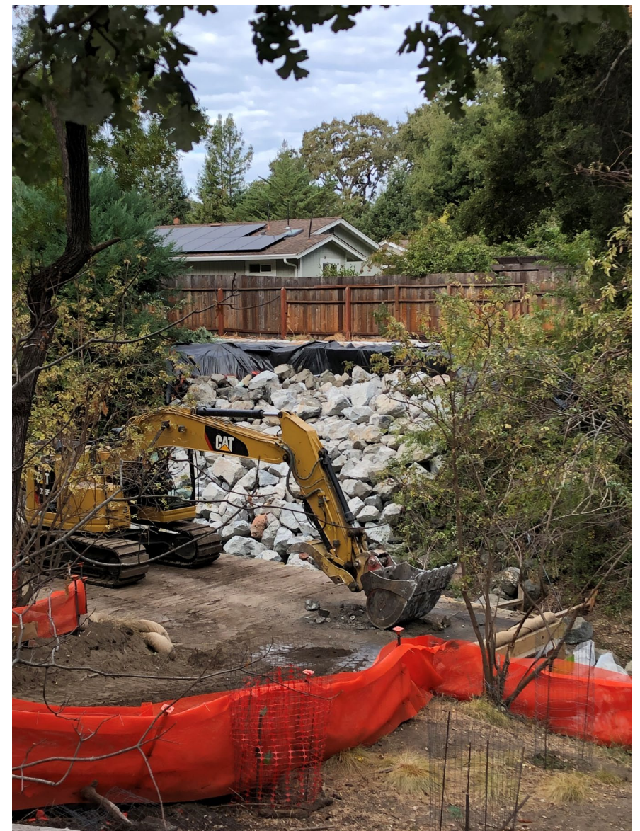
3 rd Street Slide Repair Lafayette – Briones to Las Trampas Trail

The contract terms and limits are a minimum offer of $50,000 in work with a maximum limit of $2,000,000 per contract.