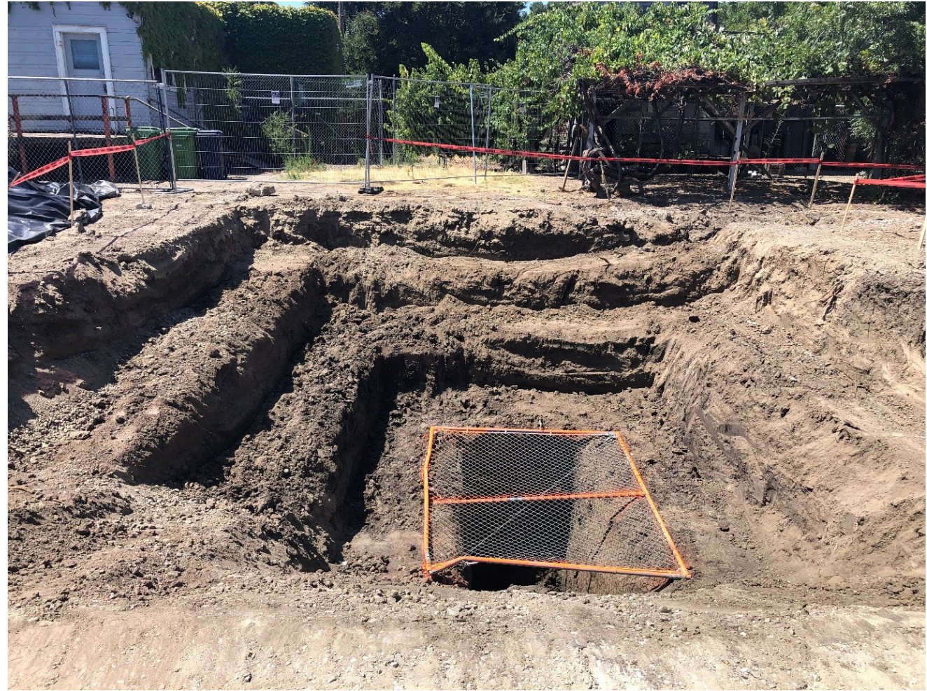
Borel Underground Storage Tank Removal