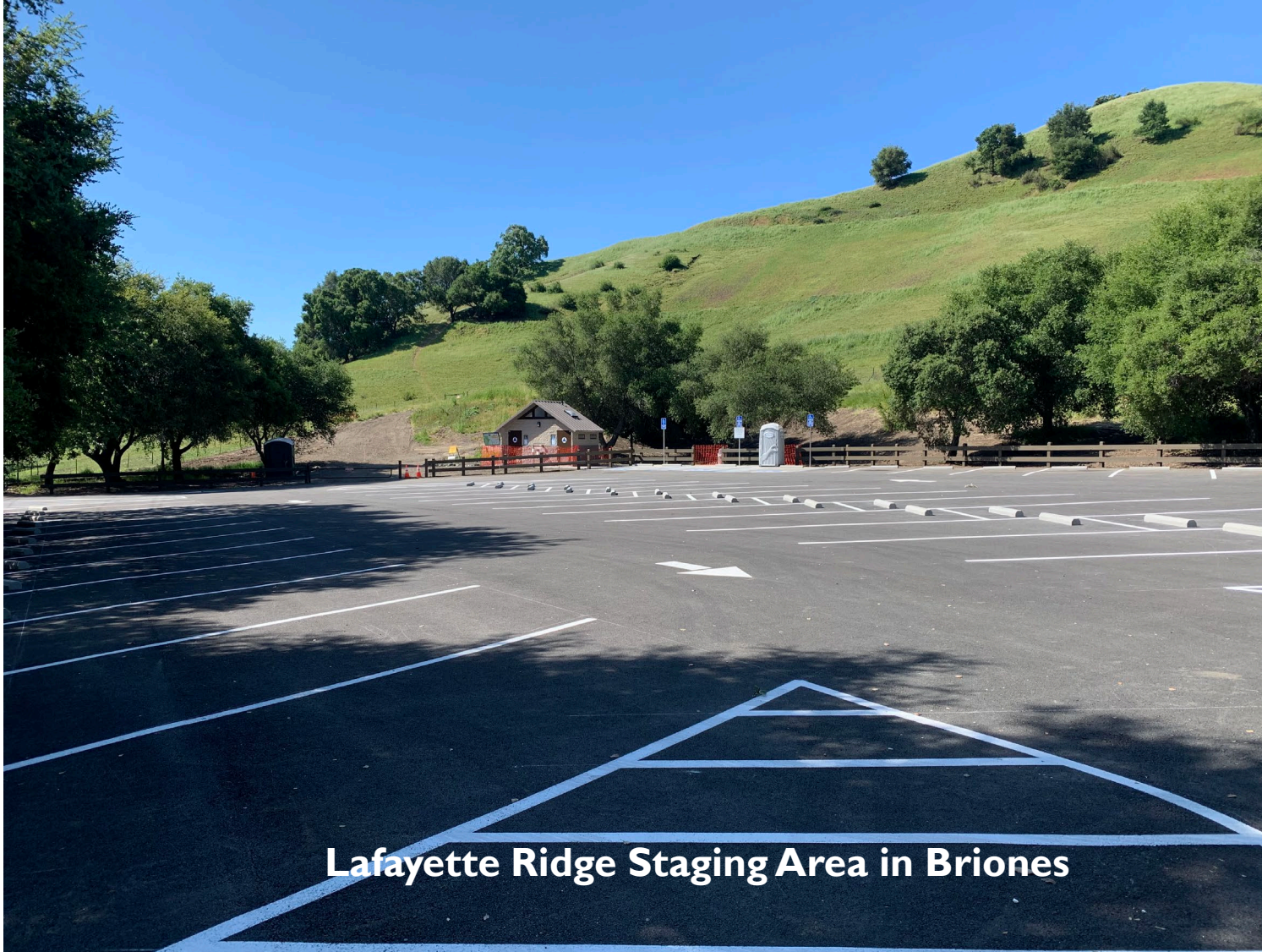
Lafayette Ridge Staging Area in Briones