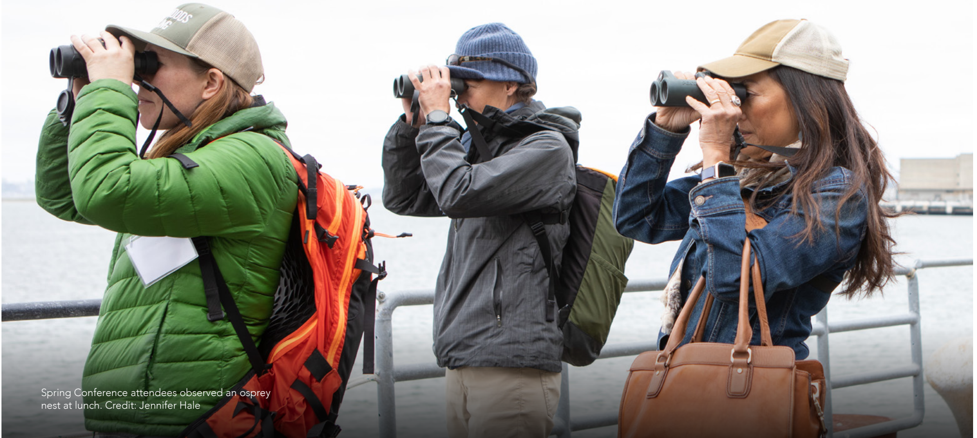
Spring Conference attendees observed an osprey nest at lunch.

A Bay Area that is home to healthy lands, people, and communities where we address the impacts of the climate and biodiversity crises through collaboration. We live in a just and equitable society where we live in right relations with the lands that sustain us now and will sustain future generations.