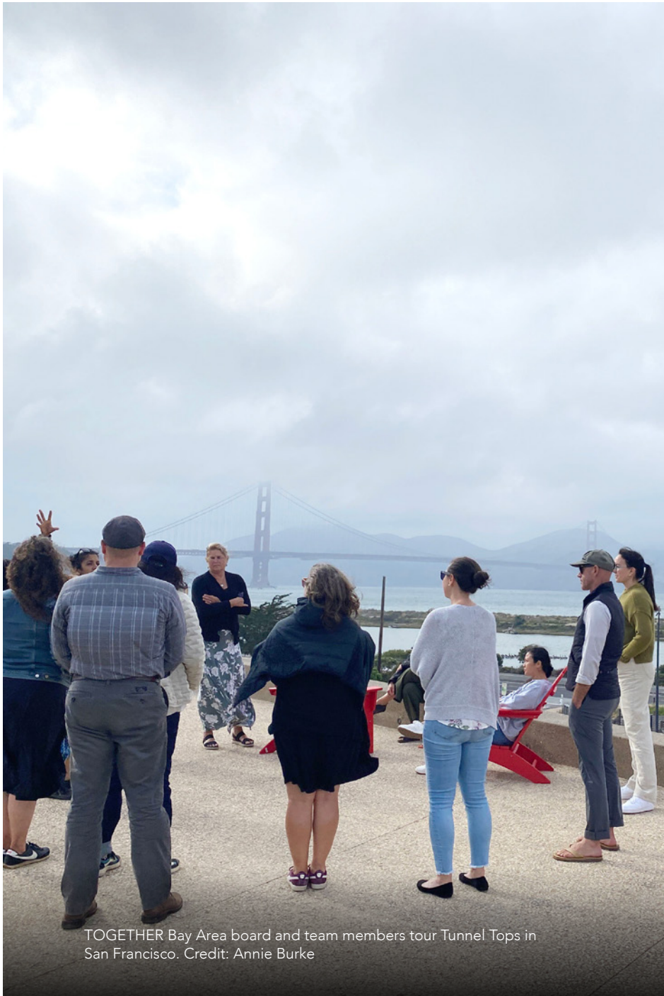
TOGETHER Bay Area board and team members tour Tunnel Tops in San Francisco.