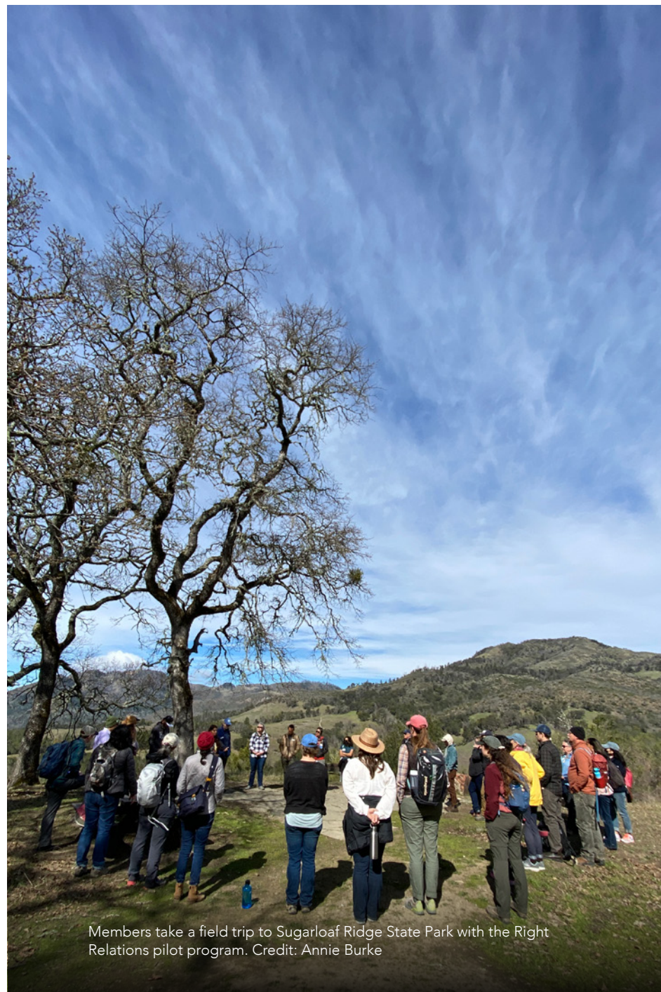
Members take a field trip to Sugarloaf Ridge State Park with the Right Relations pilot program.

https://togetherbayarea.org/right-relations/