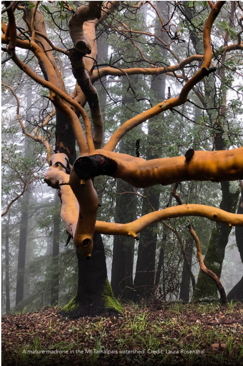
A mature madrone in the Mt Tamalpais watershed.