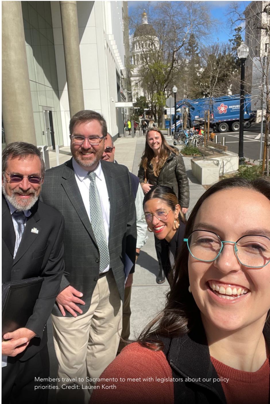
Members travel to Sacramento to meet with legislators about our policy priorities.